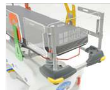
Paediatric kit head-end (optional)