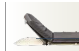
Ref CROK7 X-Ray cassette below the patient surface