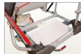
Ref CRODOC Chart holder (for paperwork) below the headrest