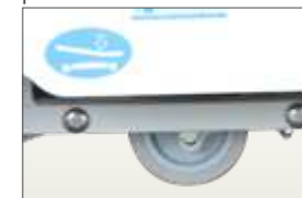
Ref CRO5E 5th directional wheel