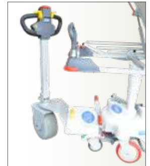
Click & Move and I-Care