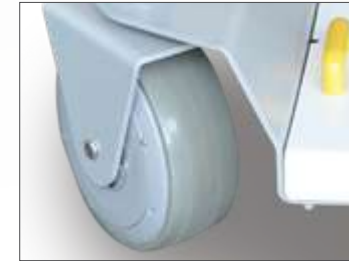
Autonomous motorized wheel with integrated battery

Charge de fonctionnement en sécurité : 320 kg