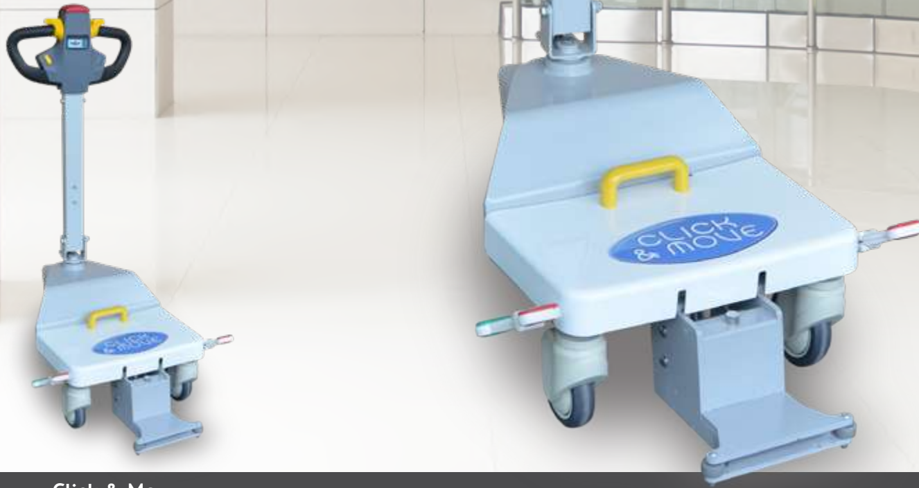
Click & Move Motorized drive system with autonomous wheel.