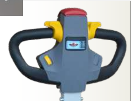
Forward / backward twist grip with progressive speed acceleration.