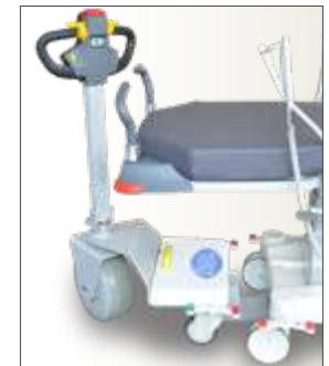
Click & Move and Clavia