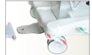
Réf BDM-BRA-CAR/CLV/ICA Connection for Click & Move