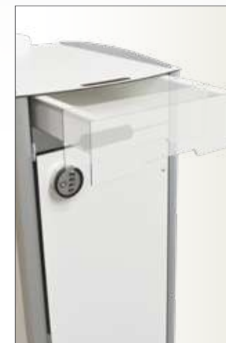
Drawer for the storage of your patients' personal effects