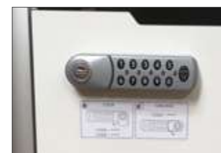
Digital door and drawer lock.