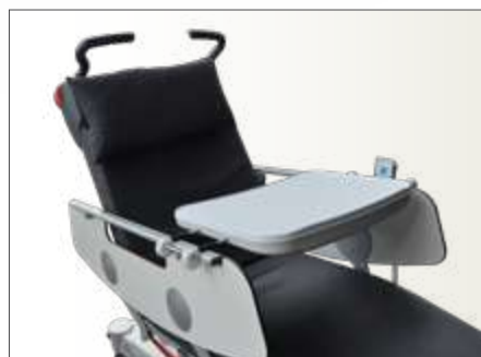
Universal meal tray on CLAVIA LSA with laminated side guards