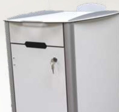
Bedside cabinet / Locker Included shoes tray