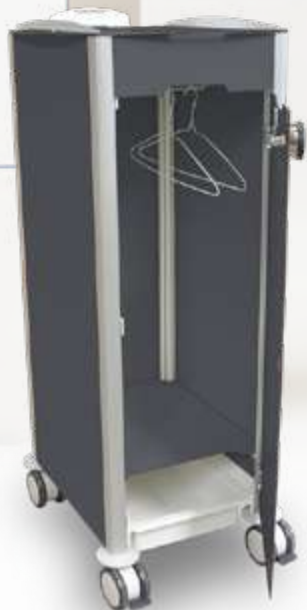
Bedside cabinet / Locker Included wardrobe