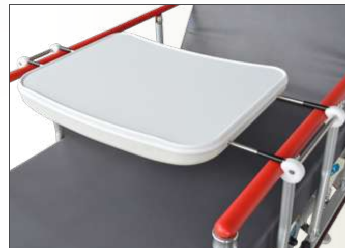
Universal meal tray fits with all width of products