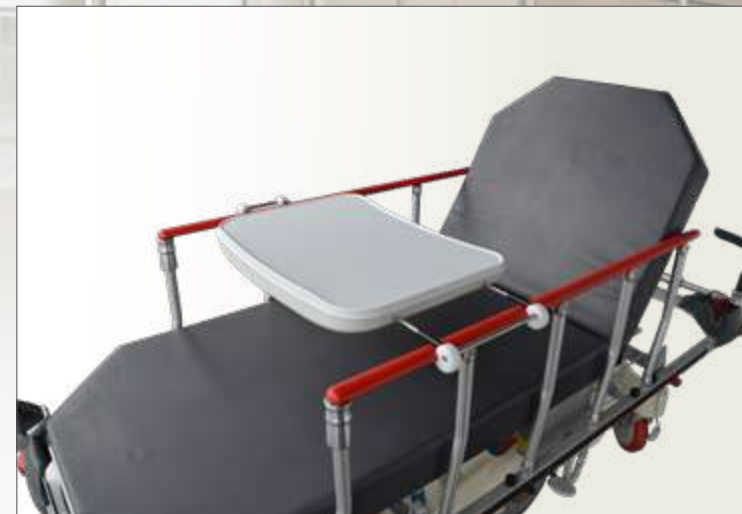
Universal meal tray on I-CARE trolley