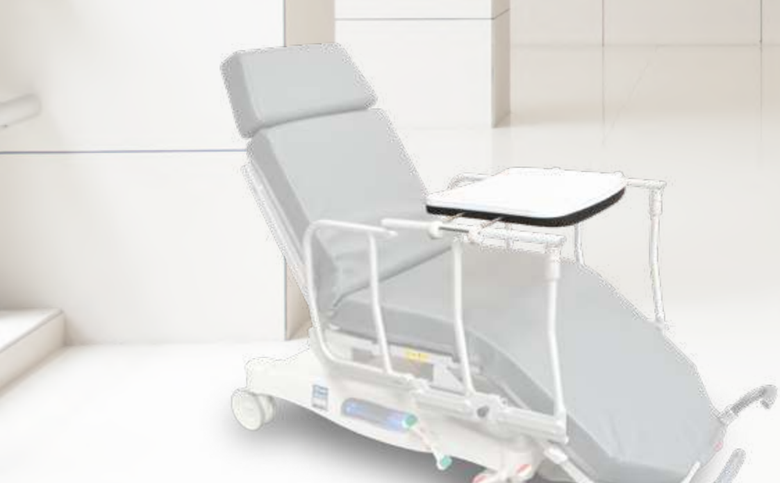
Universal meal tray on CLAVIA LSA SURGERY