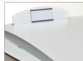
Identification system for patient / care chair / locker