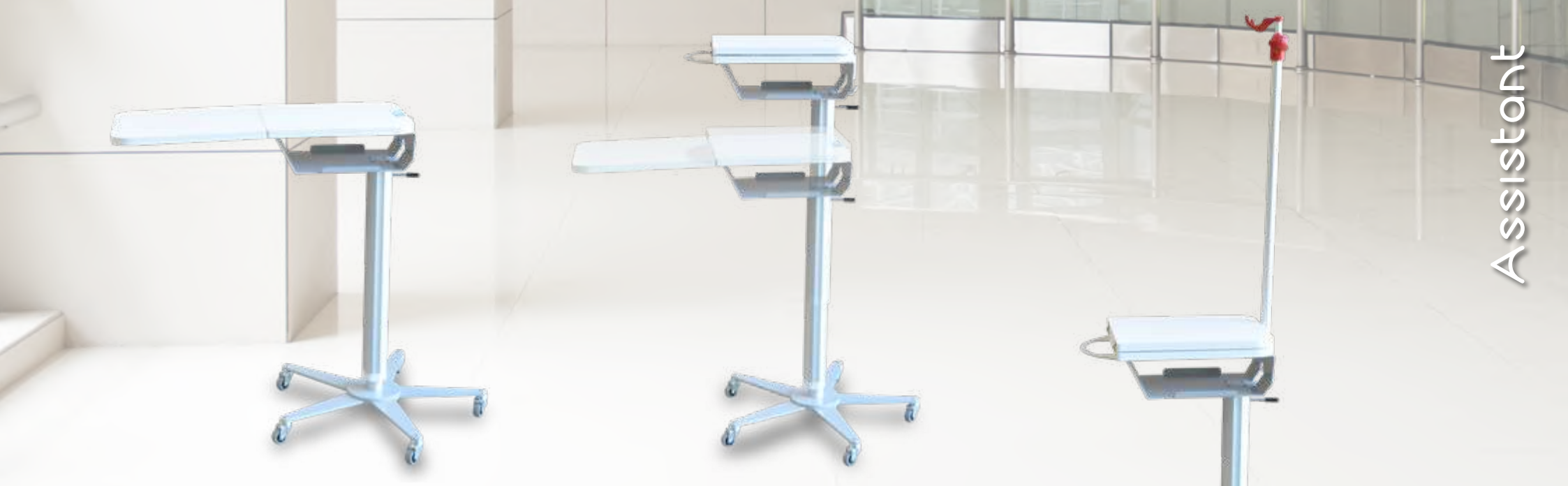
Assistant Height adjustment with gas spring foldable Table-Top