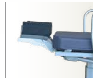
Ophthalmologic headrest (optional)