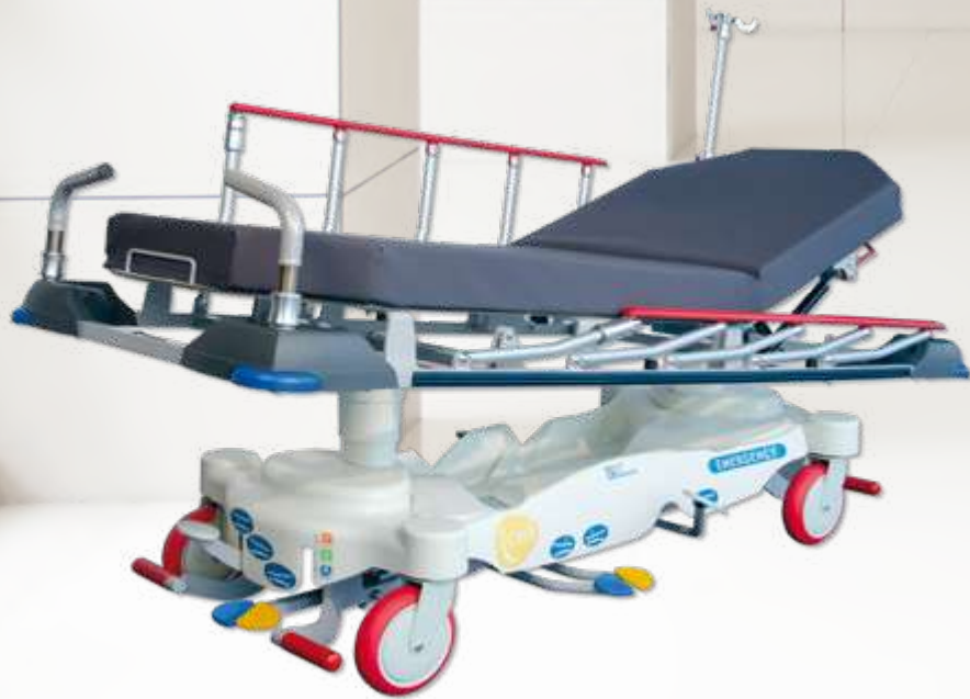
I-CARE Emergency 60 / Emergency 70 Patient trolley With hydraulic height adjustment