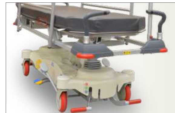
Detail view foldable push handles