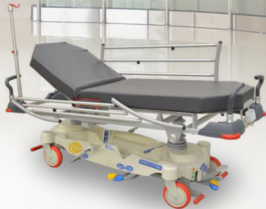
I-CARE Ambulatory 60 / Ambulatory 70 / Ambulatory 80 Patient trolley With hydraulic height adjustment