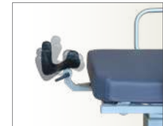
Stomatologic and ENT headrest (optional)