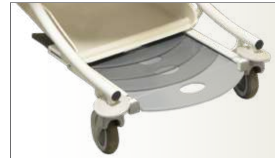
Sliding and self-blocking foot rest