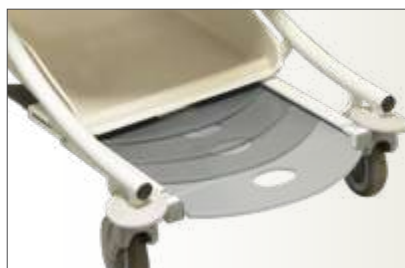
Sliding and self-blocking foot rest