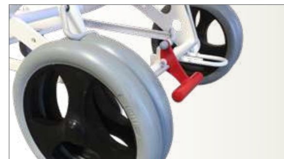
Zoom on the twin back wheel Ø 300 mm with central braking system