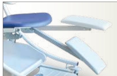
Two positions leg rest (optional)