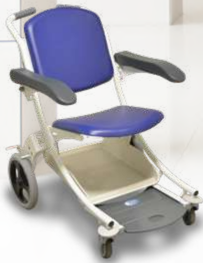
Patient transport chair I-MOVE For the patients' reception