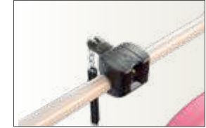
Ref TROMO Coin acceptor