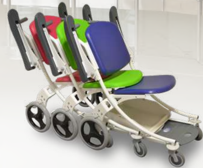
Stackable patient transport chair I-MOVE for optimized tidying