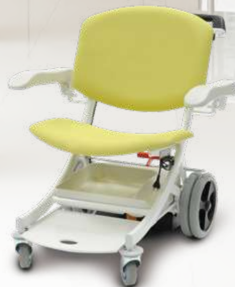
Motorized patient transport chair I-MOVE EZ-GO