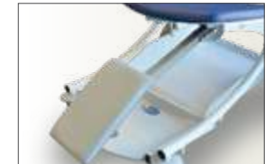
Ref TRORJ Adjustable leg rest