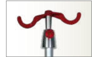
Ref TSR2 IV pole, 2 hooks