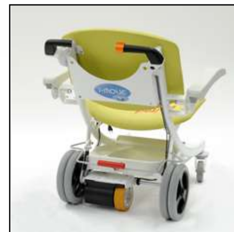
Motorized wheel including battery.