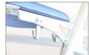
Ref PSU Hooks to hold bag